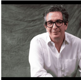
Editors' Note: Many Fast News images are stylised illustrations generated by Dall-E. Photorealism is not intended. View as early and evolving AI art!