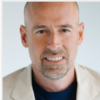
SCOTT GALLOWAY NYU Stern School of Business