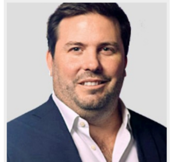
DAMIAN EALES News Corp